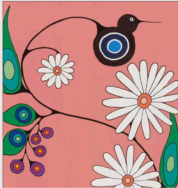
Messenger of the Past, Present, and Future

"My vision is for all children to know that they are loved."